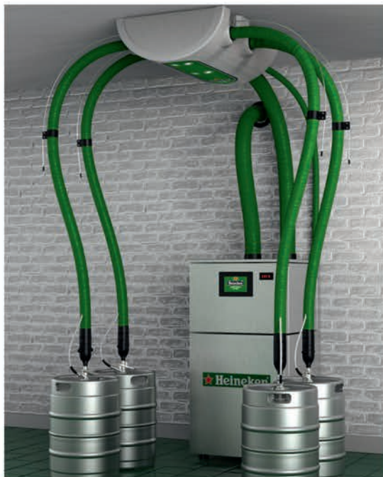
PERFECTION: HEINEKEN SmartDispense is a simple, cost-effective way of reducing energy costs and beer wastage while improving margins and sales

For more information visit www.smartdispense.heineken.co.uk