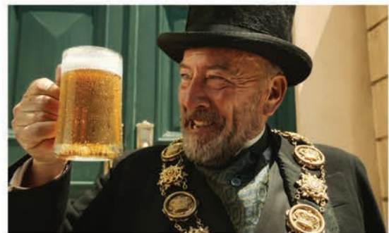
PROFILE: Every HEINEKEN brand receives high-profile multimedia advertising and in-outlet support and promotion

with lower draught beer and cider volumes the cost implications of a traditional cellar often outweigh the return on investment.