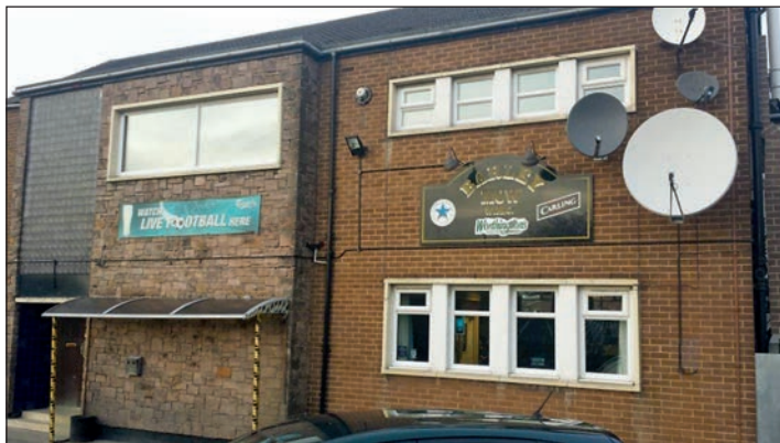
Barley Mow WMC near Gateshead and (below) Darfield Village Club have become the latest CIU clubs to fit Smart Energy's low wattage heating panels.